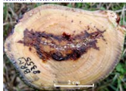
D – Section of branch (from plant in A).