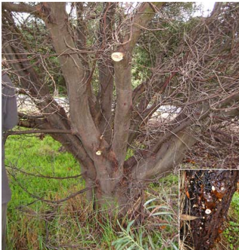
B – Stem base (with insert showing gum exudation).