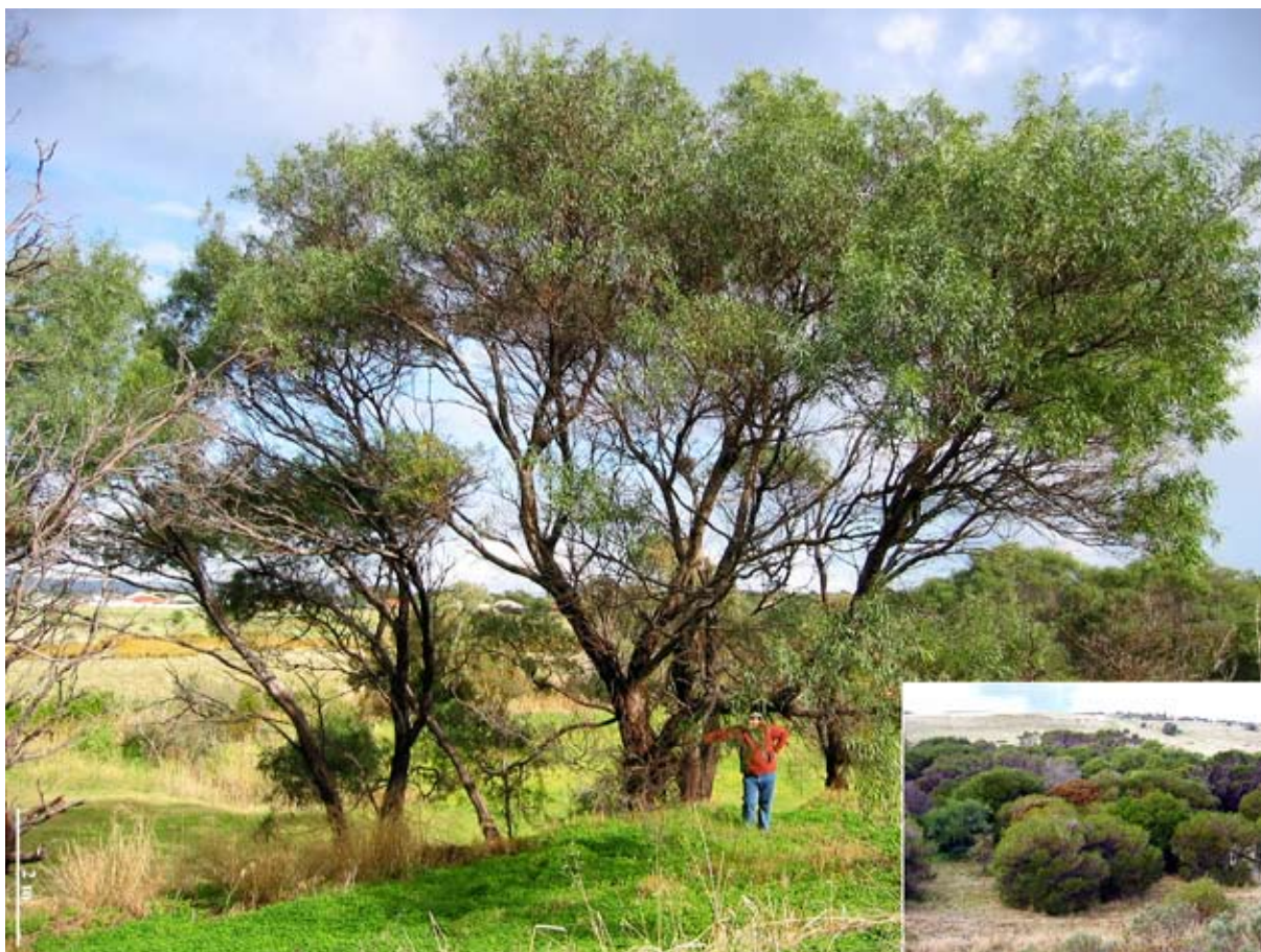
A – Mature tree with large quantity of wood biomass (insert showing the near-population).