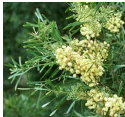
C – Branch showing pale-coloured heads in racemes.