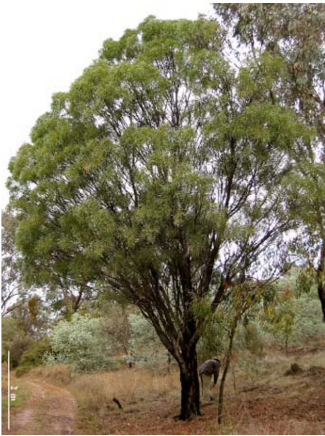
A – Mature plant in open site (note straight, stout stems/branches).