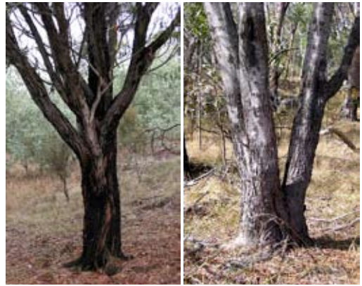
B – Stem base variation, branching above ground (left) & 3 stems from ground level (right).