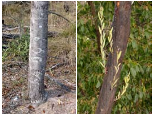
C – Single stem (left) & stem showing weak epicormic growth (right).