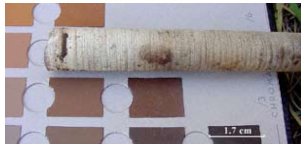
F – Stem core.