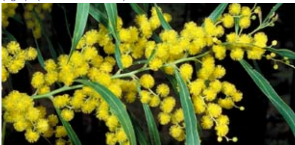
E – Branch showing heads in racemes.