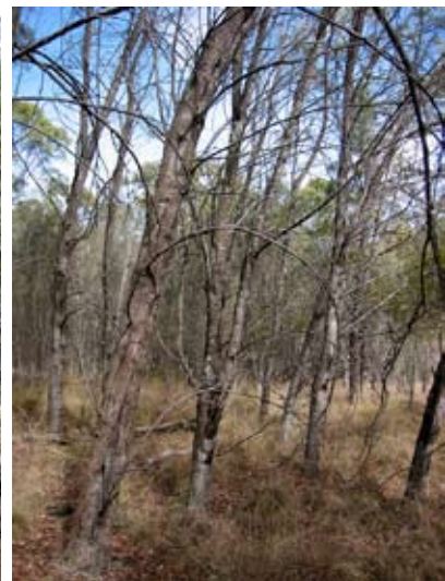
D – Plants in same population showing erect growth habit (left), spreading branches (center) & closely-spaced regeneration (from seed) (right).