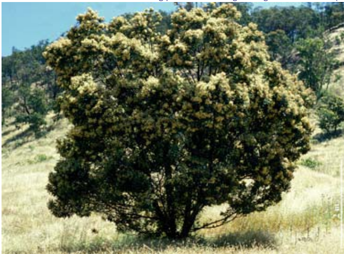
B – Adult plant in open site showing spreading crown & stems dividing near base.