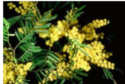
D – Branches showing bipinnate leaves & heads in racemes.