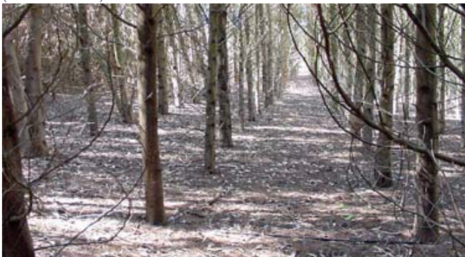
E – Plants in trial near Mt Gambier, S.A. (note straight, unbranched boles).