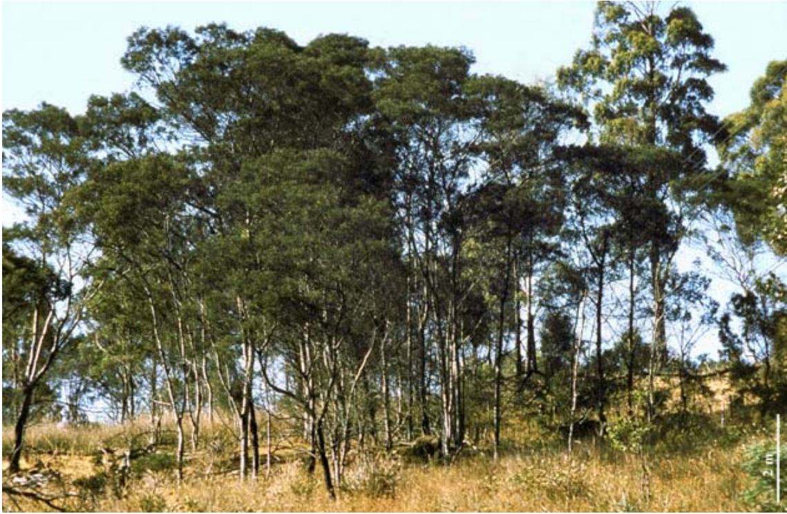
A – Mature stand in forest site showing plants with straight, single, erect stems.