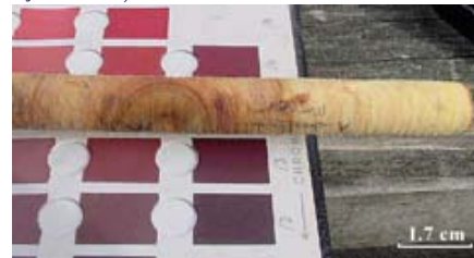
C – Stem core from 5 year old plant in trial at Kowen, Australian Capital Territory.