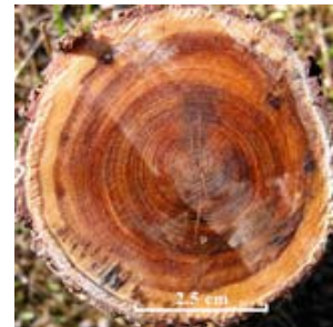
C – Section of stem of plant in A (wood dense).