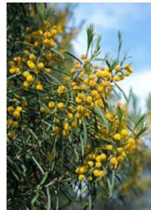
E – Flowering branch showing heads (in very short racemes) & short phyllodes.