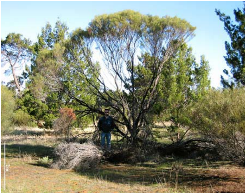
A – Old plant at Saunders Creek, S.A. (note sub-straight main stems & terminal crown).