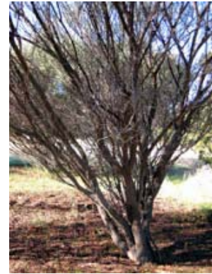
B – Stem branching near base.