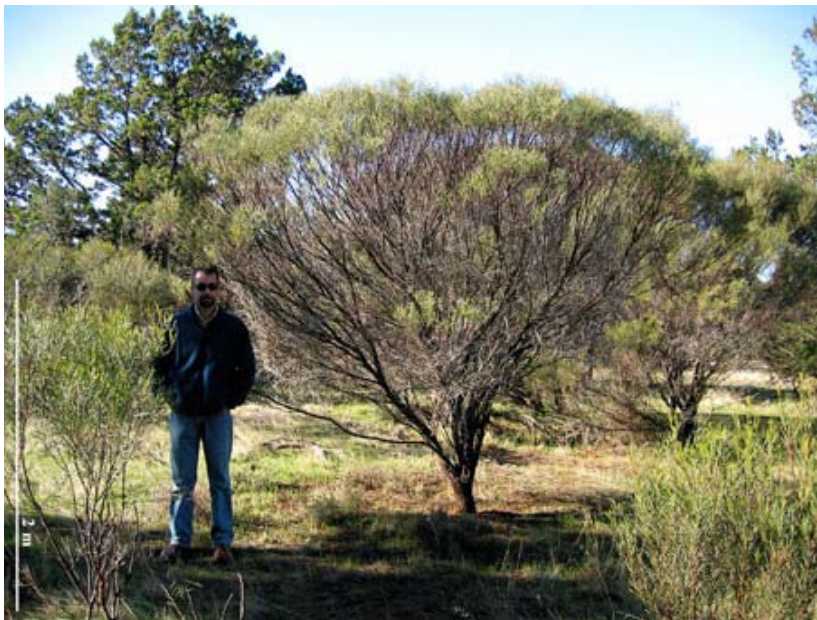
D – Adolescent plant at Saunders Creek showing typical obconic growth form.