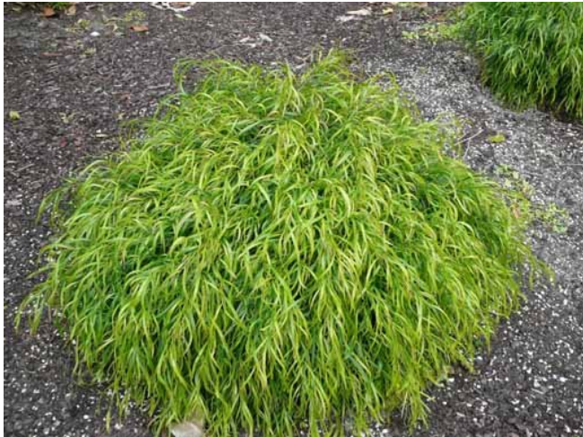
Acacia cognata 'Fettuccini'