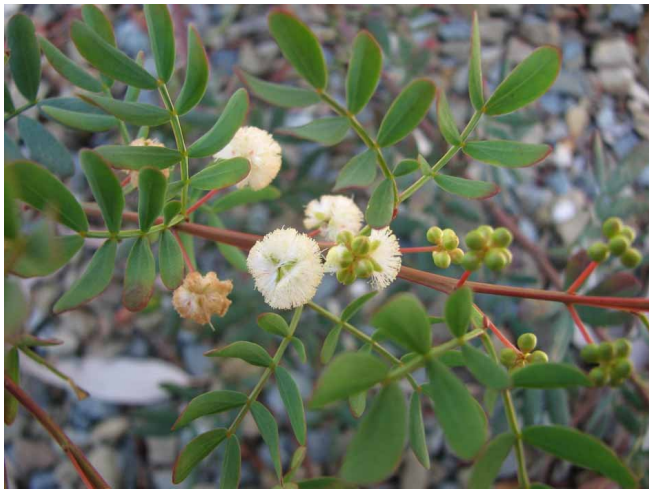
Acacia gilbertii (all 3 photos taken at Melbourne's Maranoa Gardens)

This pretty little wattle, not much more than 1m high, could be dubbed the 'white wattle' since it has rather white flowers instead of the usual yellow.