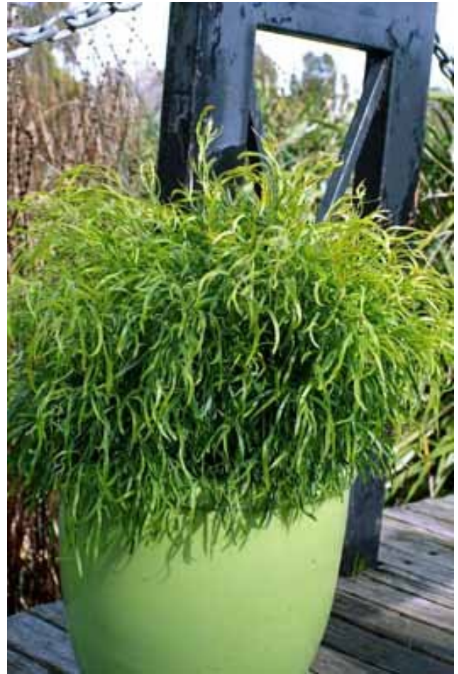
Acacia cognata 'Fettuccini'