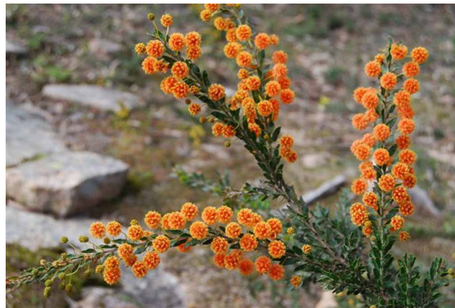
Acacia paradoxa 'Marmalade Hedge'