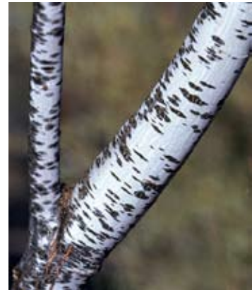
B – Young stems (white pruinose).