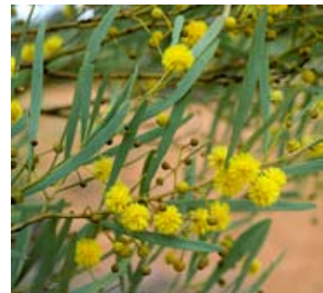
E – Branch showing golden heads (in racemes).