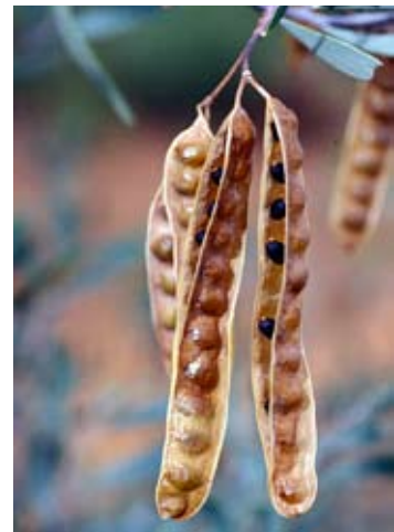
C – Mature (papery) pods.