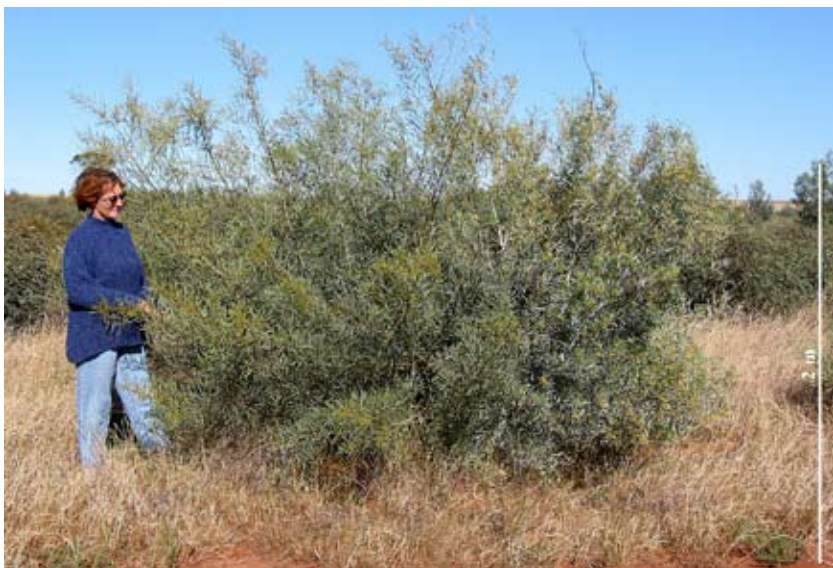
F – 2 year old plants in trials at Morawa, W.A.