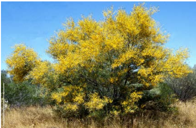
D – Adolescent plant showing bushy growth habit.