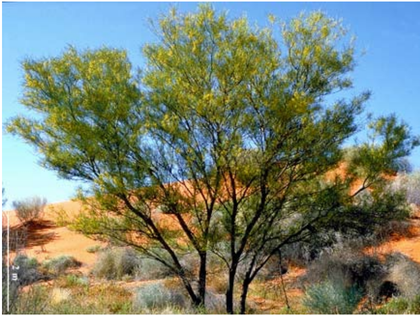
A – Adult plants in Flinders Range, S.A.